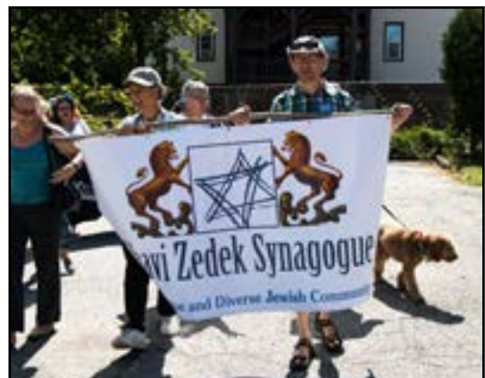
OZ team joins the 2016 Pride Parade