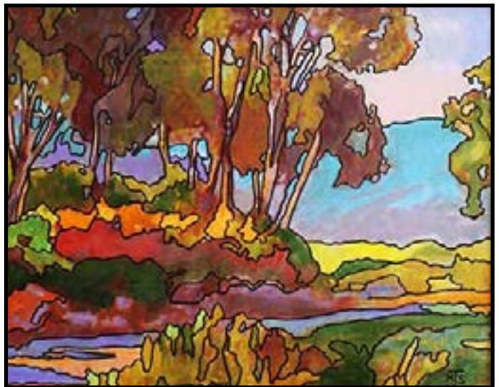
Summer Walk by Michael Strauss. See page 5

*Please note the following ongoing activities: