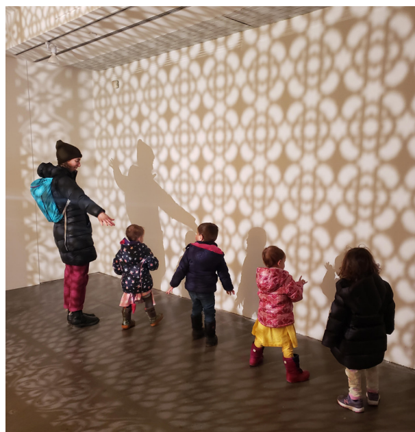
Full Circle Preschool visits Burlington City Arts