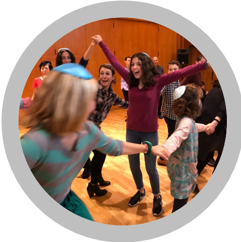
Center For Jewish Life (cultural programming)