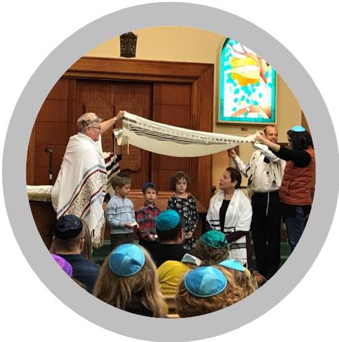
Religious and Spiritual Experiences